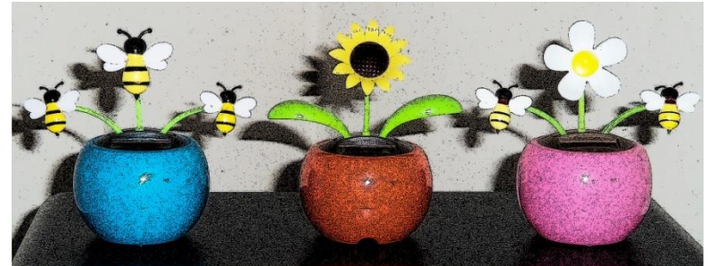
May Flowers Solar Figurines ink sketch.jpg